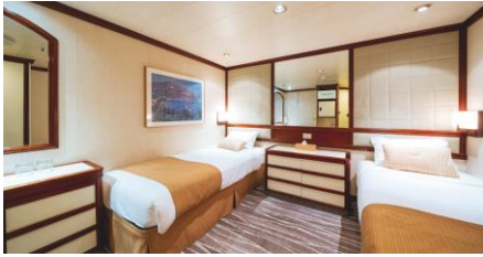
內艙房 Inside Cabin /