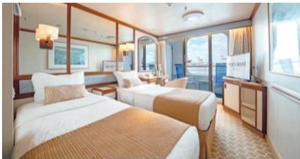
露台艙房 Balcony Cabin

Size 面積：17 m 2 Including Balcony 連露台 Deck 樓層：9 (II), 10-12 (I)