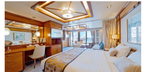
Premium Suite 豪華套房

Size 面積：33 m 2 Including Balcony 連露台 Deck 樓層：10