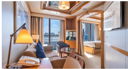
迷你套房 Junior Suite

Size 面積：17 m 2 Including Balcony 連露台 Deck 樓層：9 (II), 10-12 (I)